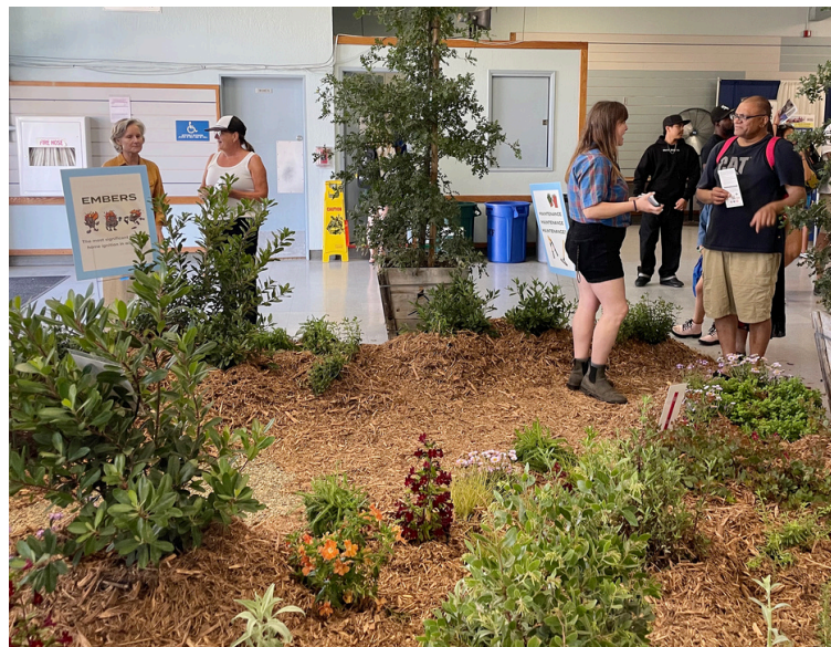
Resilient Landscapes Coalition members and Master Gardener volunteers answer questions at the 2025 Wildfire and Earthquake Expo. This annual hands-on event helps Sonoma County residents be better prepared for the next wildfire or earthquake. The Expo is the largest in-person emergency preparedness event in Sonoma County.

During the June 1, 2025 Wildfire and Earthquake Expo, Coalition partners set up a demonstration garden at the Sonoma County Fairgrounds to illustrate appropriate plant selection and hardscape options in the three defensible space zones. We were included as part of a Channel 7 news report about the event!