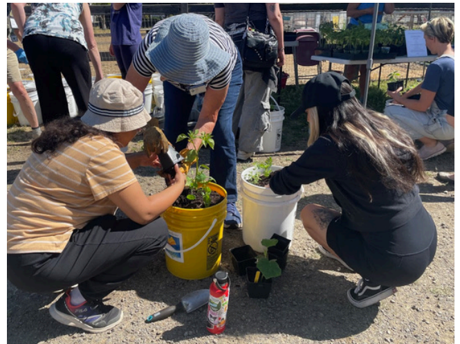
Community members plant herbs and vegetables in containers at a Portable Container Garden workshop held at the Petaluma Health Center.

The program primarily serves Spanish-speaking families, low-income households, elders and renters who experience disproportionate barriers to food access and gardening education. Delivering workshops in familiar, trusted locations has resulted in strong participation, repeat engagement, and positive feedback from both participants and partner organizations.