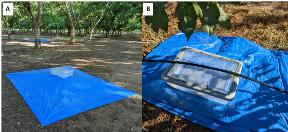
Orchard sampling stations used to detect live Phytophthora in water from A , sprinklers, and B , drip emitters.

We found that Phytophthora commonly survives the journey from surface water sources into the orchard, and that the irrigation system type did not seem to matter. Also, the presence of a sand media filter did not seem to affect how regularly we detected live Phytophthora coming through irrigation emitters.