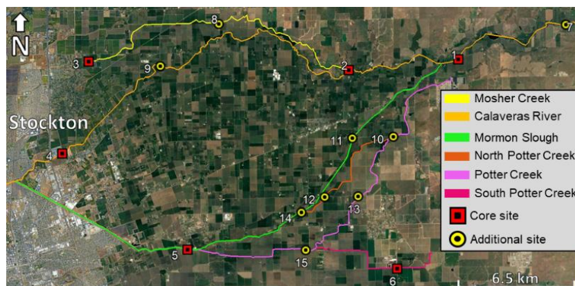
Overview of the Stockton East Water District (SEWD) with water sampling sites marked.

During the 2021 irrigation season, we sampled water from surface water irrigation sources throughout the SEWD. Some locations (core sites) were sampled monthly from June through October, and some locations (additional sites) were sampled twice during the season, in July and October. Samples were taken back to the lab and tested for Phytophthora using DNA sequencing.