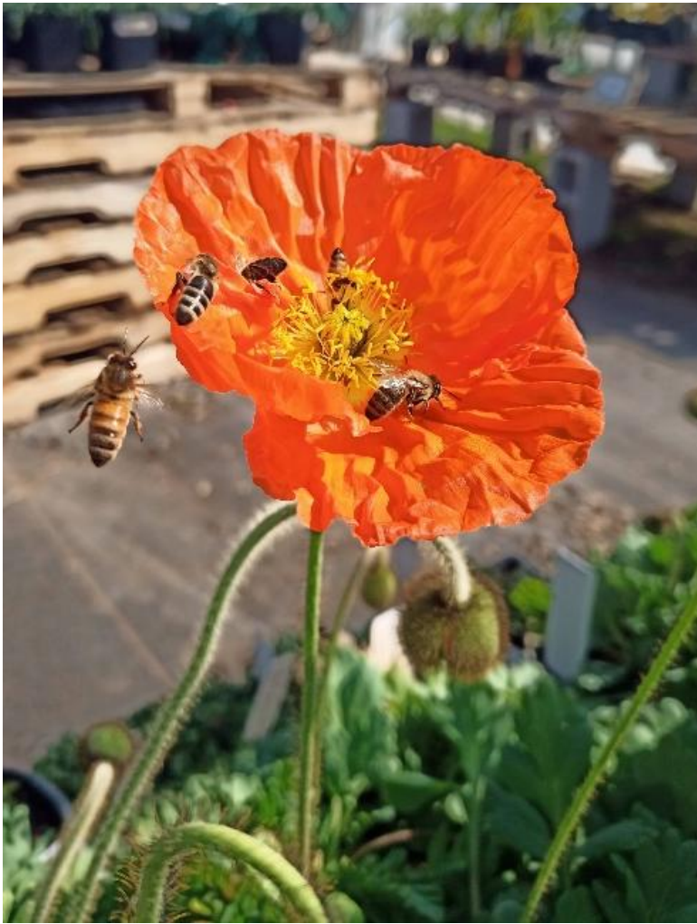
Figure 1. Honeybees foraging on an Iceland Poppy.

present. Follow the Best Management Practices published by the Almond Board of California carefully to help optimize honey bee health in your orchards. Utilize BeeCheck through the BeeWhere California app to stay aware of the location of honeybee hives in neighboring fields.