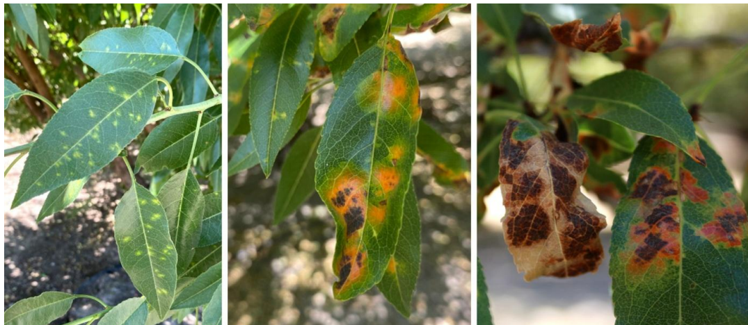
Figure 1. Early symptoms of Red Leaf Blotch include small, pale yellowish spots or blotches (left: early-May). The leaf blotches turn orange to reddish-brown as the season progresses (center: mid-June; right: late July).

of RLB and identification of its causal agent, we tested and validated a polymerase chain reaction (PCR) assay (Zúñiga et al. 2018) that uses species-specific primers following DNA extraction directly from leaves. Using similar tools, P. amygdalinum was formally confirmed in 2024 as being present in the state by both CDFA and the USDA.