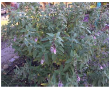
Lepechinia 'El Tigre'