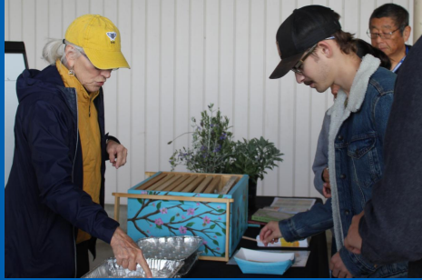
The California Master Beekeepers offered a honey tasting and lessons about pollinators.

regional projects are developed. Some of the favorites have been trips to the LA Natural History Museum, La Brea Tarpits, Oak Glen/Yucaipa Apple-Picking & Nature Hike, 4-H Night at the Ontario Reign (Ice Hockey) Game, and family meet-ups for ice skating!