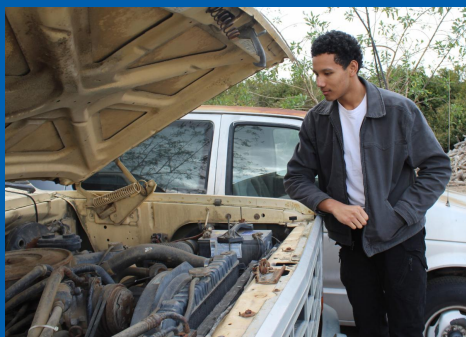
Students explored our equipment graveyard and looked under the hood of some of our oldest vehicles.