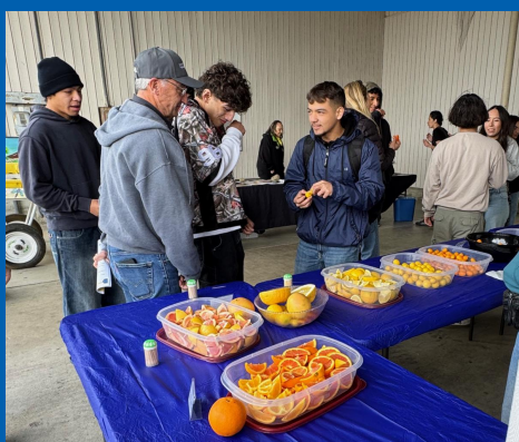
Students tasted several varieties of citrus grown at South Coast REC.

ISHB infestations (Urban Forestry Advisor-supported), and water and soil studies at the Landscapes & Research plots (Water & Soils Health Advisor-supported). OC 4-H currently has a countywide project designed specifically for the homeschool family with hands-on, project-based learning housed on Tuesdays at SCREC and Fridays with community-based field trips focused on civic engagement.