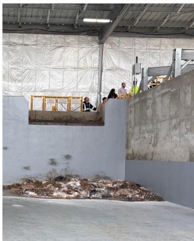
This is how the organic waste arrives at the center. Since it's