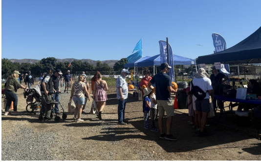
Folks were lined up to purchase their u-pick pumpkins and drought-tolerant landscape plants!