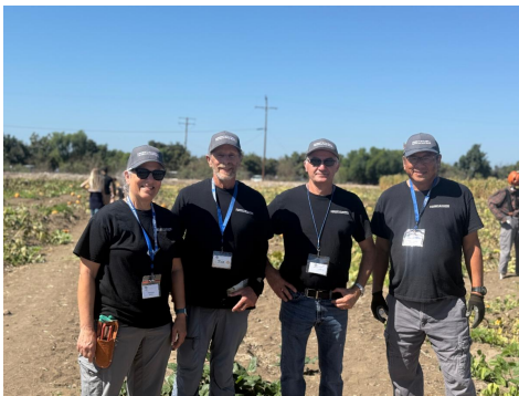
Some of our awesome, dedicated South Coast Stewards volunteers who helped make sure the event ran smoothly!