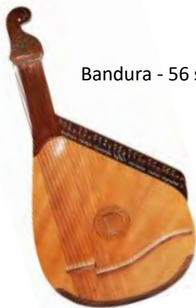
Bandura - 56 strings !