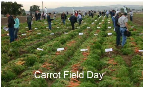
Carrot Field Day