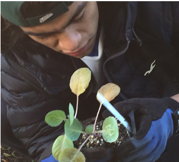
Marin Oaks High School Garden Dirt Club, Novato