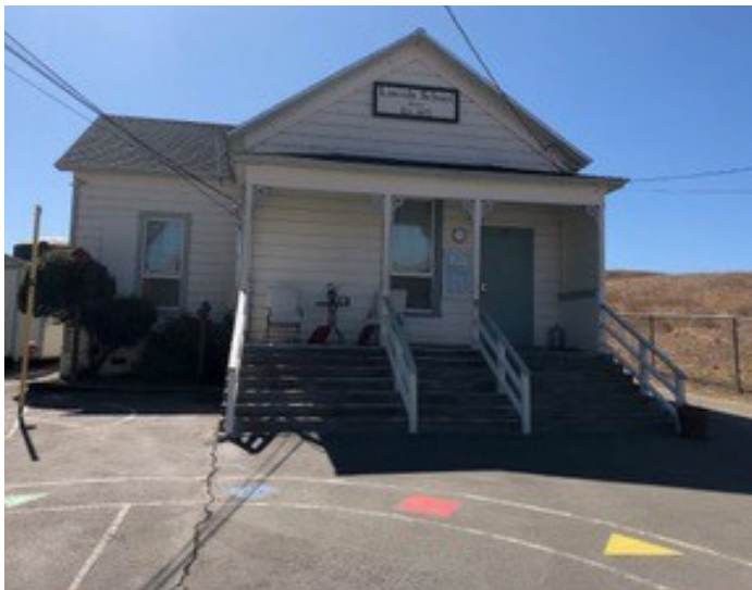
The Lincoln School House and Garden