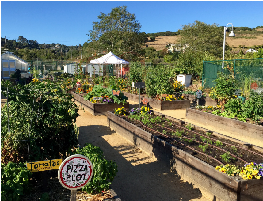
The Mill Valley Children's Garden at Edna Maguire Elementary School, Mill Valley