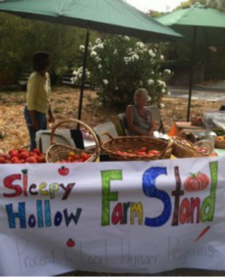
Photos: top - Sleepy Hollow Presbyterian Church Garden, and bottom - Sleepy Hollow Presbyterian Church Farm Stand, San Anselmo

Bank and other local hunger programs. The farmstand now helps to keep the garden costs covered while SHPC continues to provide fresh local produce to Marin’s hungry. In addition, SHPC is a model of garden sustainability through their use of a large rain tank that feeds some of the garden’s water needs during the summer.