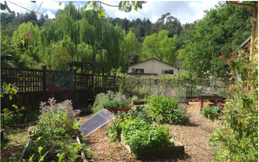
Davidson Middle School Garden, San Rafael