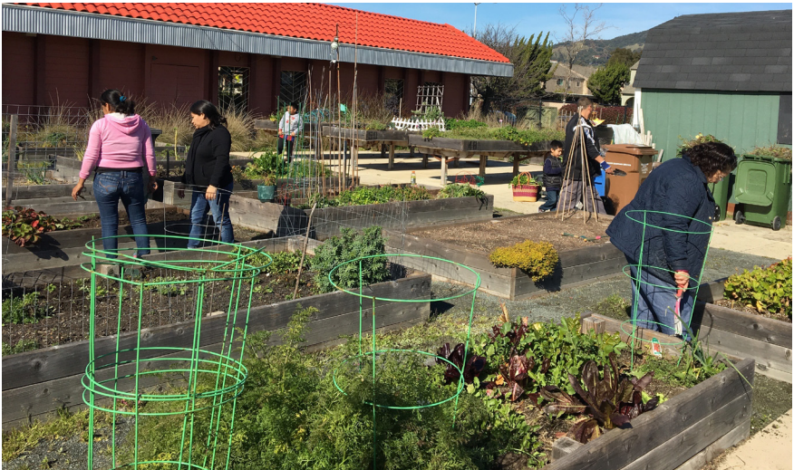
Canal Community Garden, San Rafael