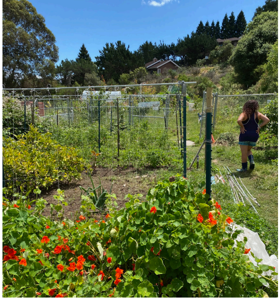
San Pedro School Garden Farm, San Rafael