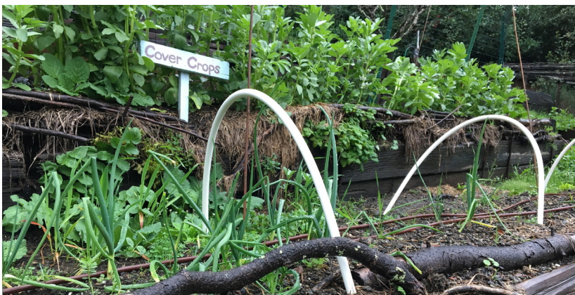
Cedars Textile Art Center's Hands & Earth Garden, San Rafael