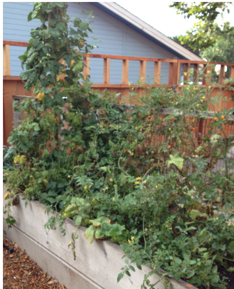
Papermill Children's Corner, Pt Reyes

In 2004, with the increase in childhood obesity nation-wide, North Bay Children's Center (NBCC) decided to make changes to its food program and set out to secure funding that would create opportunities to teach children and their parents about fresh, healthy food options by way of growing some of their own! The grant they were awarded established NBCC as one of California's first on-site learning gardens for children under the age of five. The main garden, The Garden of Eatin' was finished in 2006 at the Novato C Street Campus. Subsequent satellite gardens were developed at all NBCC center sites. NBCC encourages family engagement through garden events, and promotes a culture of health in all aspects of their school and communities.