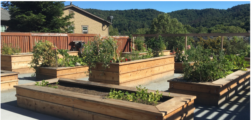
Photos: top - Gardening at Maria B Freitas Senior residence, San Rafael, and bottom - Mackey Terrace, EAH Housing for seniors and disabled, Novato