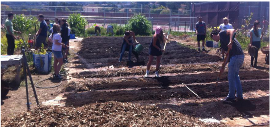
Redwood High School Sustainable Farm, Larkspur