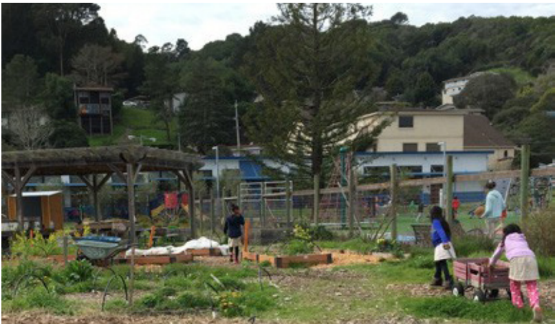
Bayside Martin Luther King Junior Academy school garden, Marin City