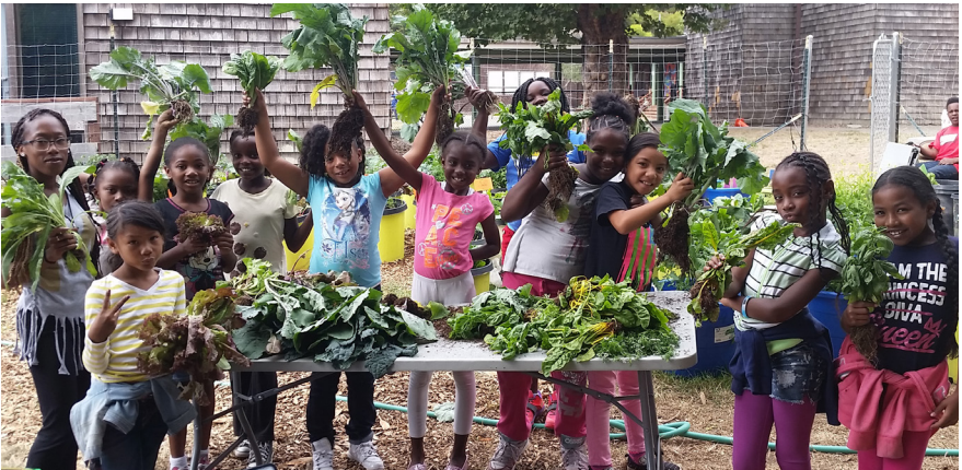
Marin City Community Services District's Children's Summer Container Garden