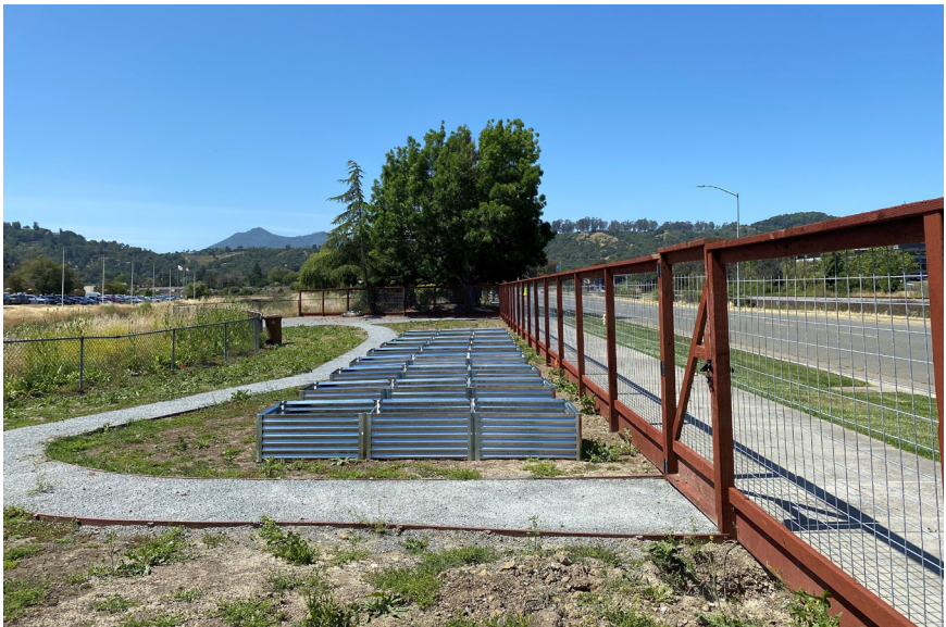
Embassy Suites' Red Oak Farm, San Rafael

And last but not least, a newer Marin garden is Red Oak Farm , a community garden and farm being built by San Rafael's Embassy Suites. It will provide organic produce to the hotel restaurant, as well as to Marin's food insecure communities. As an outdoor venue for educational and entertainment purposes, it will model how beautiful a food garden can be, and how important for a healthy community. With the Agricultural Institute of Marin's Farmers Market right next door, the options for collaboration are boundless!