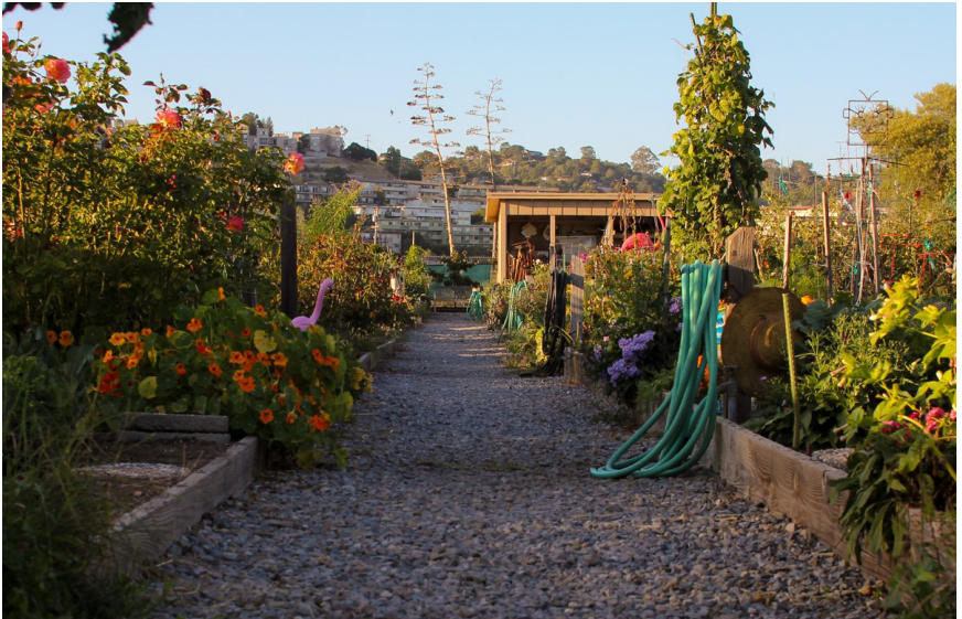
Photos: top - Robson-Harrington Neighborhood Community Garden, San Anselmo, and bottom - Larkspur Community Garden