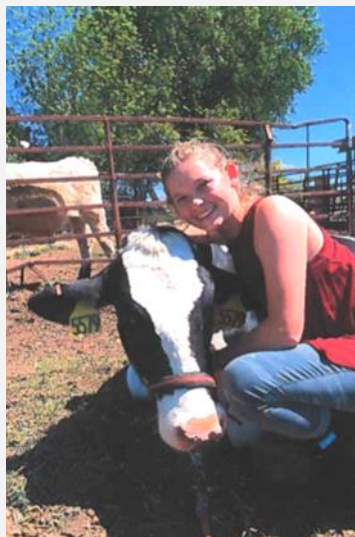
Thea Baldrige Plaza 4-H Club

Dan Gomes Family Outstanding Dairy Award Perpetual Dairy Award