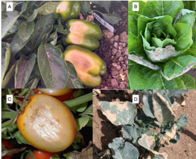
Figure 3. Sun and heat damage for (A) peppers (UC Davis); (B) burning along the edges of leaves on romaine (UCANR); (C) sun damaged tomato (UCANR); and (D) broccoli leaves

Excessive summer heat increases water and energy costs, stresses farm workers, and damages crops. When crops' heat tolerance thresholds are exceeded, sunscald, stunted growth, wilting, and yellowing of leaves can significantly reduce yield and quality (Figure 3). Common adaptation strategies, such as increasing irrigation to cool plants, transitioning to heat-tolerant crops, or building partial-shade structures, can be costly and impractical for large-scale field production systems.