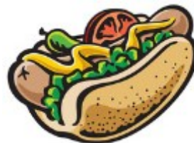
Chicago char dog on a poppyseed bun !!