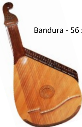
Bandura - 56 strings !