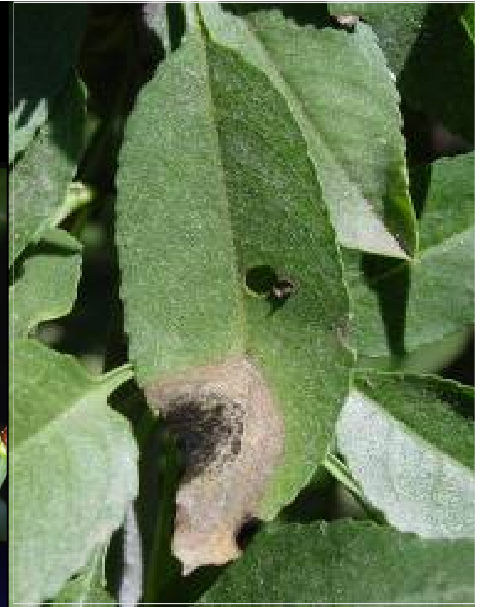
ALTERNARIA LEAF SPOT