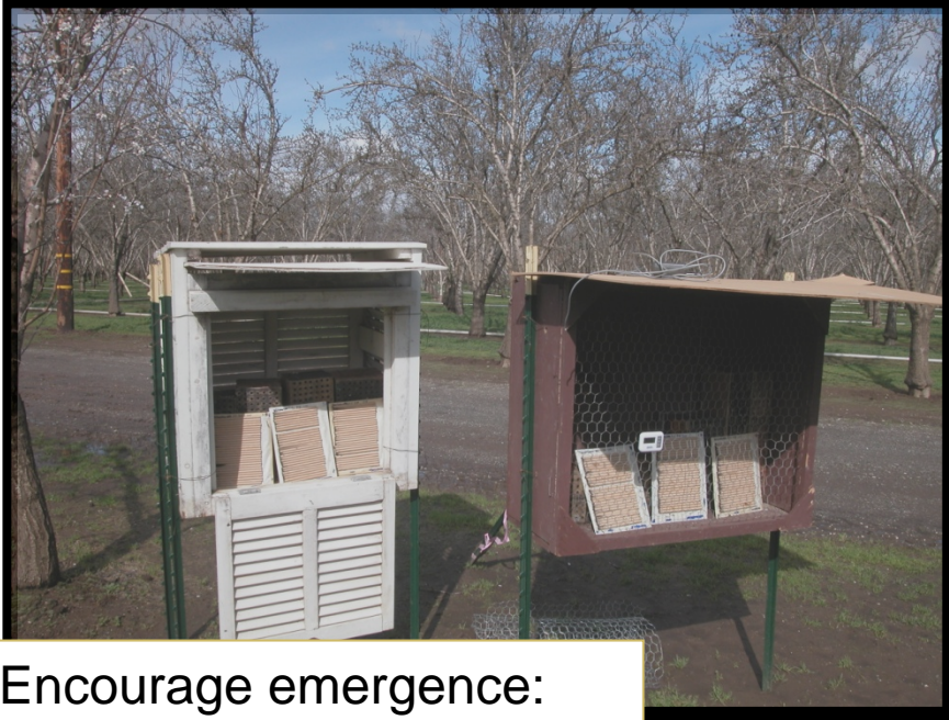
Encourage emergence: warm straws in sun