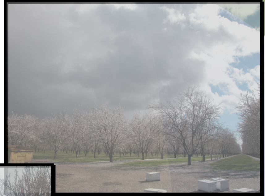
Feb 25, 2009