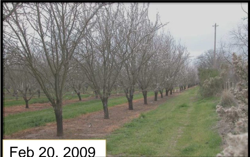
Feb 20, 2009