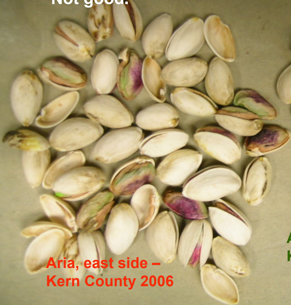
Aria, east side – Kern County 2006