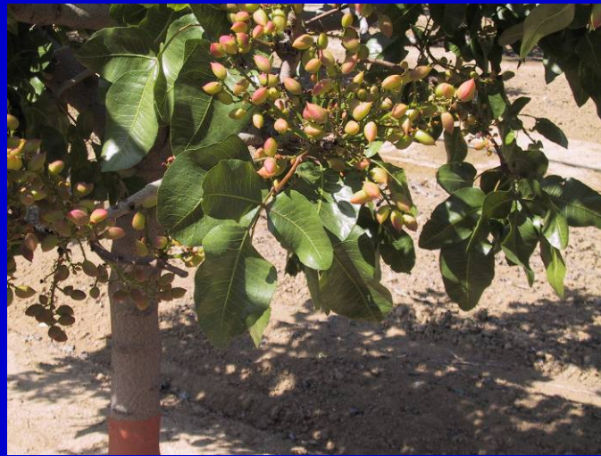
Big floppy leaves