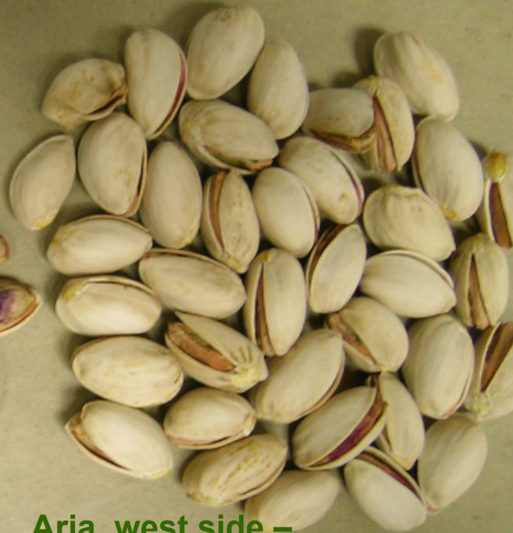
Aria, west side – Kern County 2006