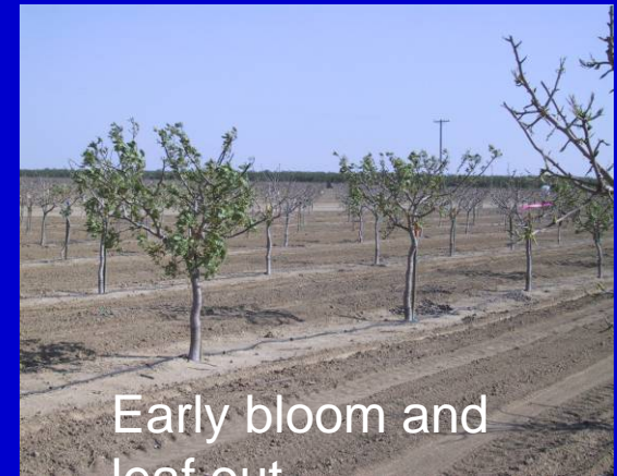
Early bloom and leaf out