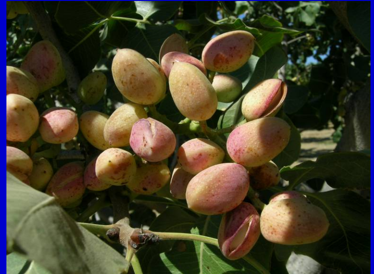
Early split nuts in Aria