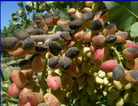
Sun burned nuts