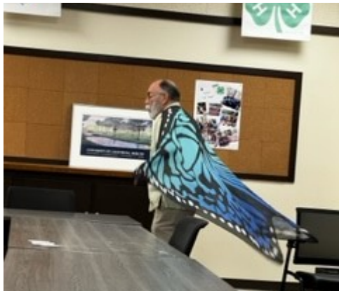
A butterfly in the classroom?