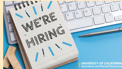
UNIVERSITY OF CALIFORNIA Agriculture and Natural Resources