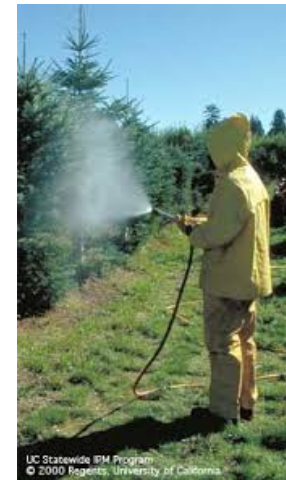
UC Statewide IPM Program © 2000 Regents, University of California