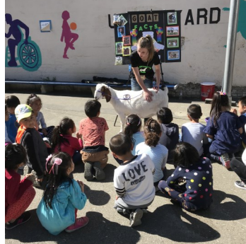
Madysson-Big Springs 4-H