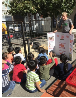
Kaden-Big Springs 4-H