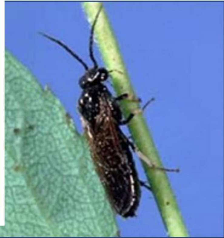
Adult bristly roseslug.