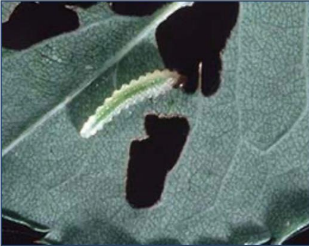
Larva of bristly roseslug.